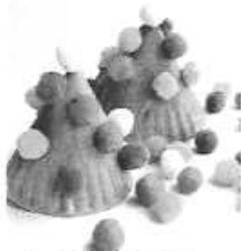
Paper Plate Christmas Tree

So far Term 4 has been great fun. We went on a trip to the Bike Park at the Velodrome in Cambridge, which was brilliant, the children loved it. We would recommend it for anyone with children, ranging from babies to teenagers.